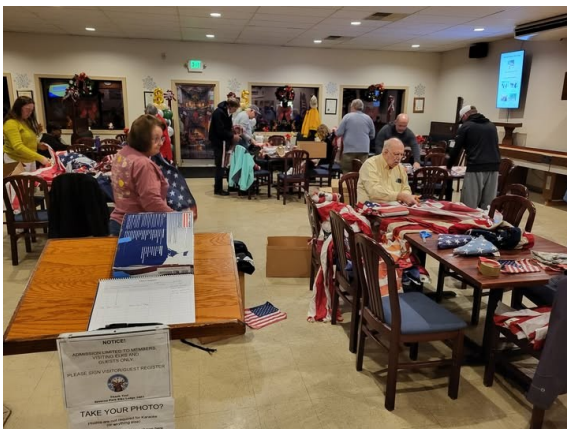
Photo right: Which principle will you focus on this month? Preparing US Flags for a proper retirement!

Love. Fidelity. Faith. Welfare. Patriotism. Fellowship. Perpetuity. Governance. These aren't just words—they're our daily charge. When we live them wholly, we don't just improve our Lodge; we elevate our communities and ourselves.