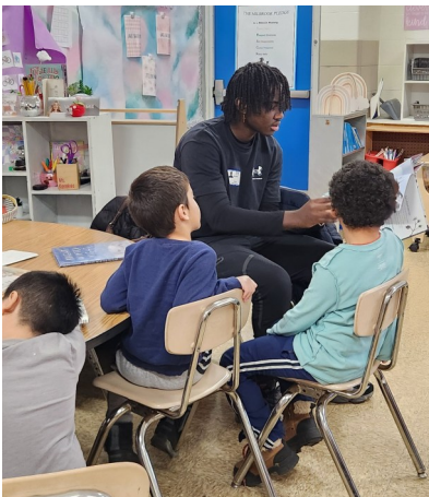
Photo left: Now we have added, reading. All schools that have received a My Cozy Corner, we will come to your school, read to the kids, work on their reading skills, and then give each child a book to call their own.