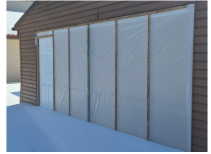
Photo below shows the enclosure.