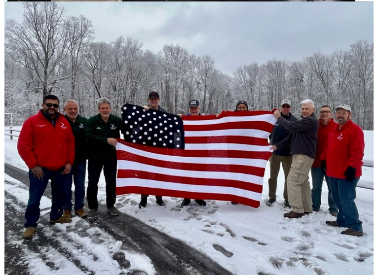
War Fighter Advanced Staff and attendees hold a hand crocheted flag bed cover - a prize for their next fundraiser.