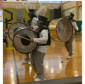
There was a band and cheerleaders.