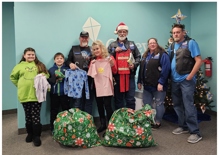
Elks Riders held a large fundraiser bull roast and collected PJs and Toys