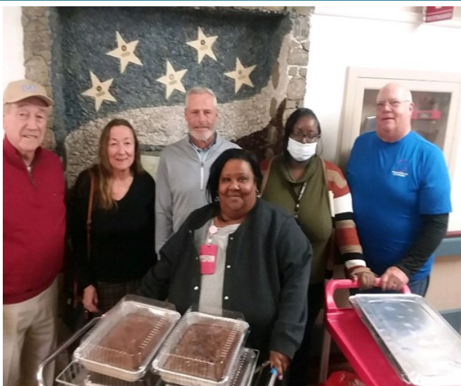
Wilmington Lodge #307 delivering Thanksgiving Dinner to Elsmere Hospital workers.