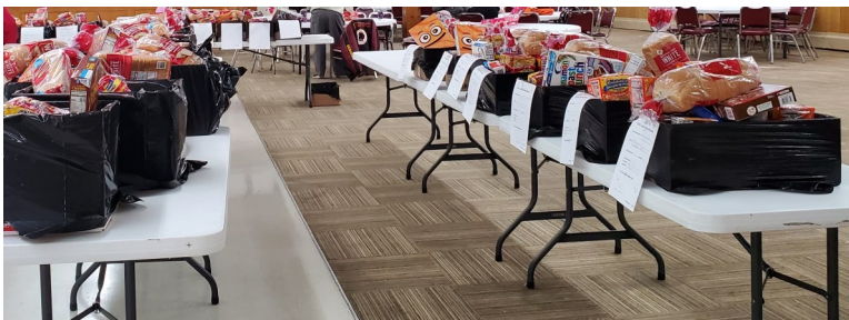
Submitted by Deb Davies Sprecher, Leading Knight

The many gift baskets are pictured below: