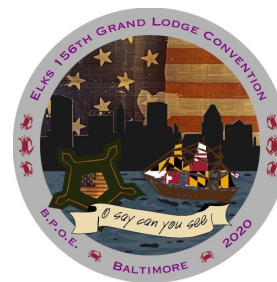
Pin design for the Baltimore Convention