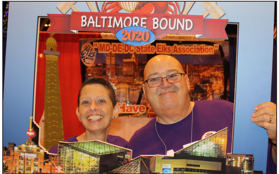
Convention visitors in 2019 pictured a future trip to Baltimore

"Elks do great things in their community through charity, but to me the most important thing I get from being an Elk is that sense of community the organization itself