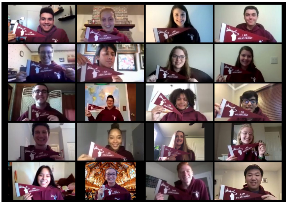
This year's Top 20 Most Valuable Student finalists participated in a video conference meeting

Before the weekend ended, the scholars shared their favorite moments of the virtual programming, and what would stick with them the most.