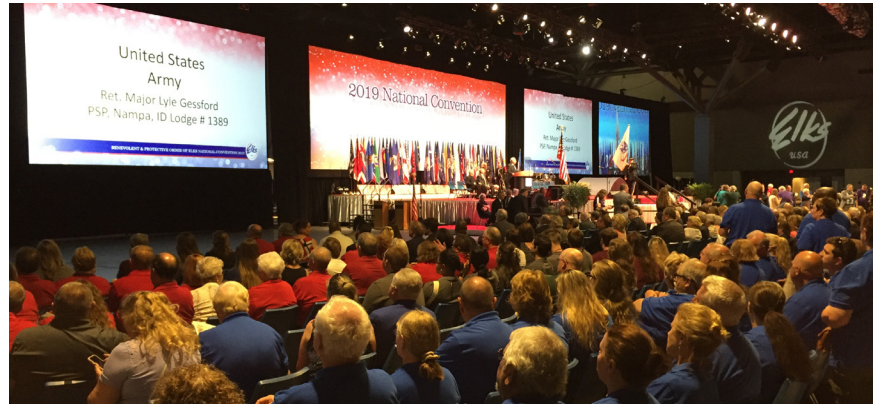
The 155th Grand Lodge Convention was held last year in St. Louis, MO