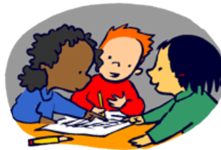
REASON FOR SUCCESS II